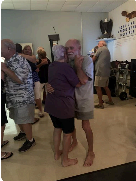
Caught this picture of him and grandma dancing once night at the Eagles.