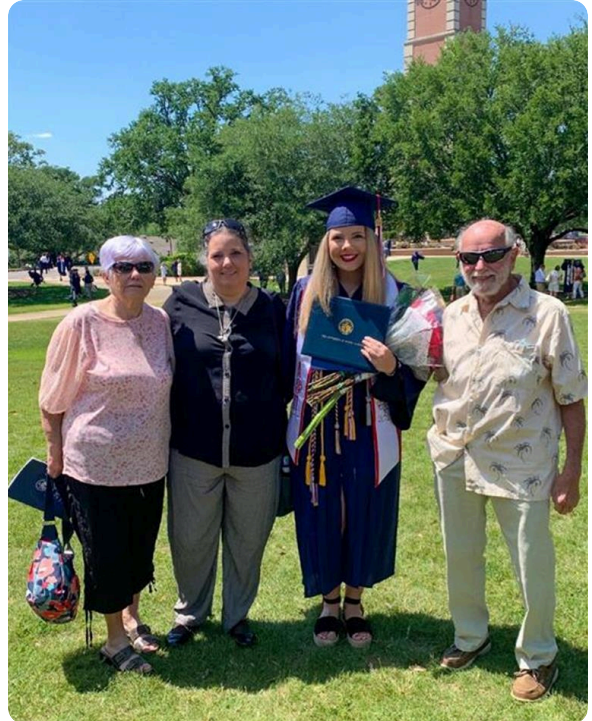
Grandpa with all his ladies.